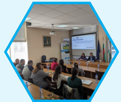
Byala Slatina, Bulgaria