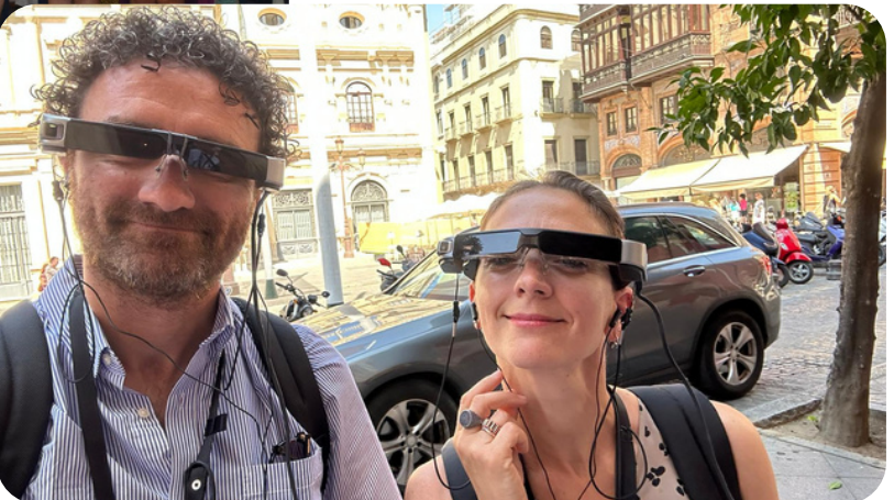
Photo below: TOURBO regional stakeholders enjoying good practice exchange in Sevilla city. Photo credit: Camara Sevilla

Photo above: TOURBO Partners during Sevilla project launch meeting. Photo credit: Camara Sevilla