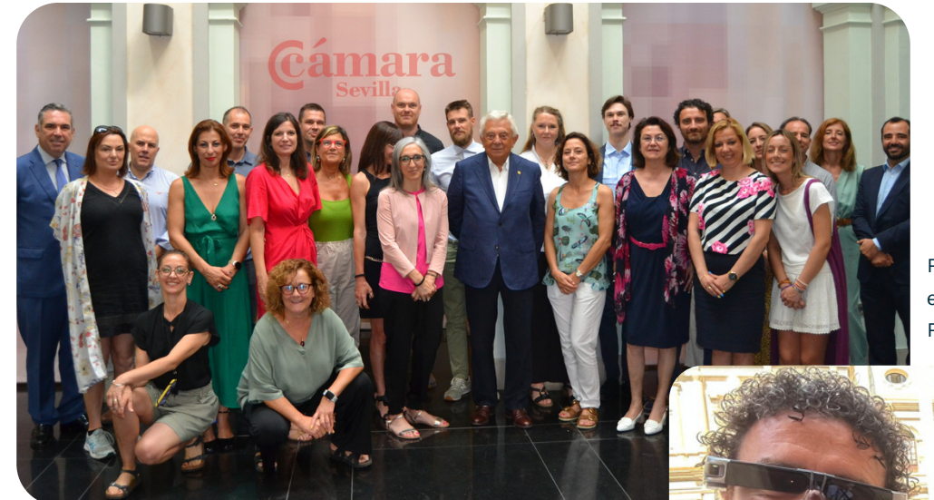
Photo above: TOURBO Partners during Sevilla project launch meeting. Photo credit: Camara Sevilla

Photo below: TOURBO regional stakeholders enjoying good practice exchange in Sevilla city. Photo credit: Camara Sevilla